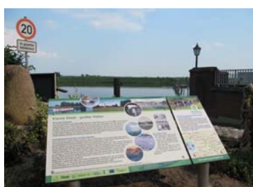
Elbe: Borderland museum