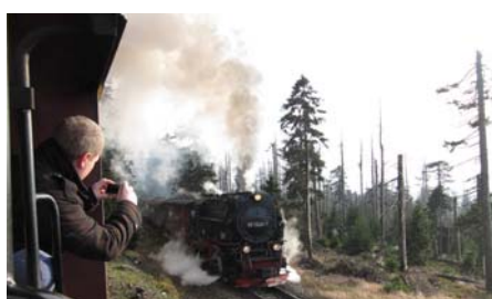
Harz: Narrow gauge railway