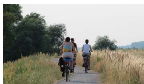
Elbe river: cycling the borderland